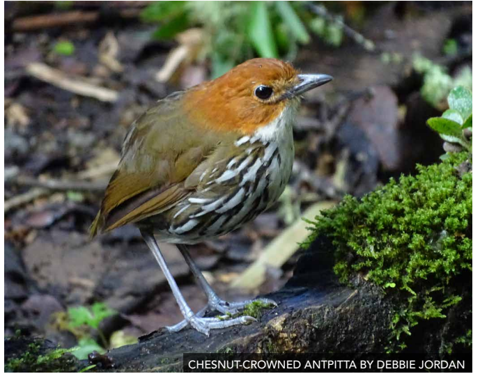
CHESNUT-CROWNED ANTPITTA