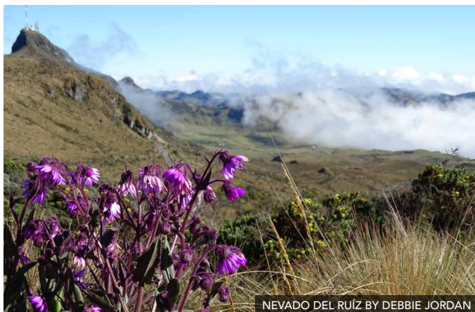
NEVADO DEL RUÍZ BY DEBBIE JORDAN

This morning, transfer to the airport for your flight home. Latest check-out time is 1 pm. (B)