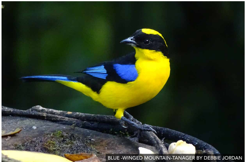
BLUE-WINGED MOUNTAIN-TANAGER BY DEBBIE JORDAN