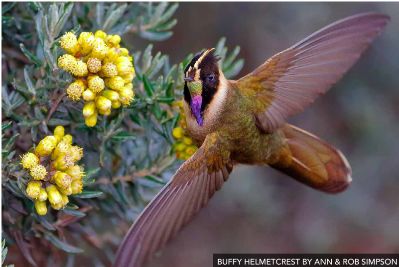
BUFFY HELMETCREST