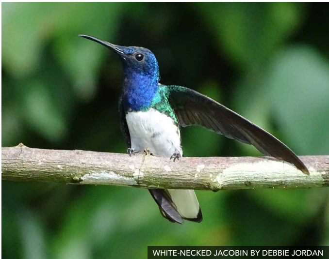
WHITE-NECKED JACOBIN BY DEBBIE JORDAN