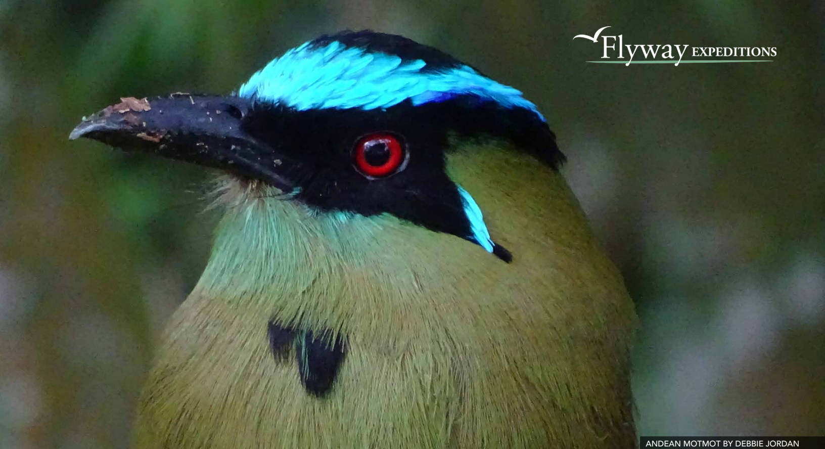
ANDEAN MOTMOT